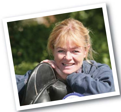
Winter Championships 2009 presentation