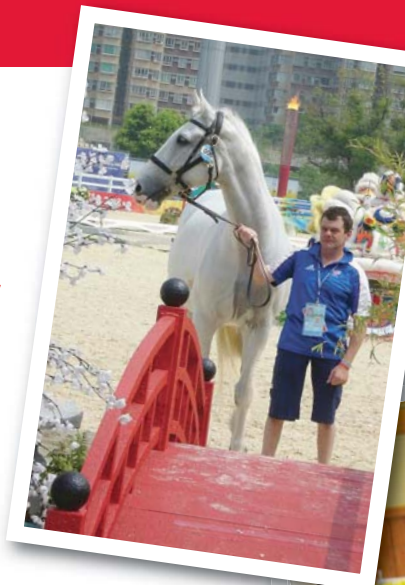
Belgium 2009 on Painted Affair, working at one with the horse

I really believe that given the right level of support, I have the capability and qualities to go all the way with Team GB.