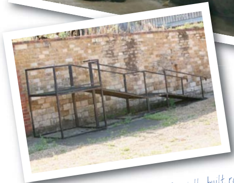
Specially built ramp