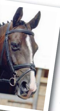
My first horse, Broadstone Picadilly